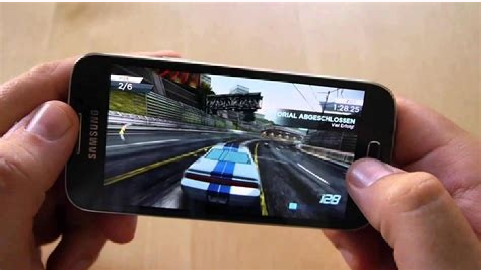
Video playback for android phone. Best video players android. Best android browser for video playback. Video playback apps for android. Best video playback player for android. Video player for android background playback. Video playback speed for android. Best video playback app for android.