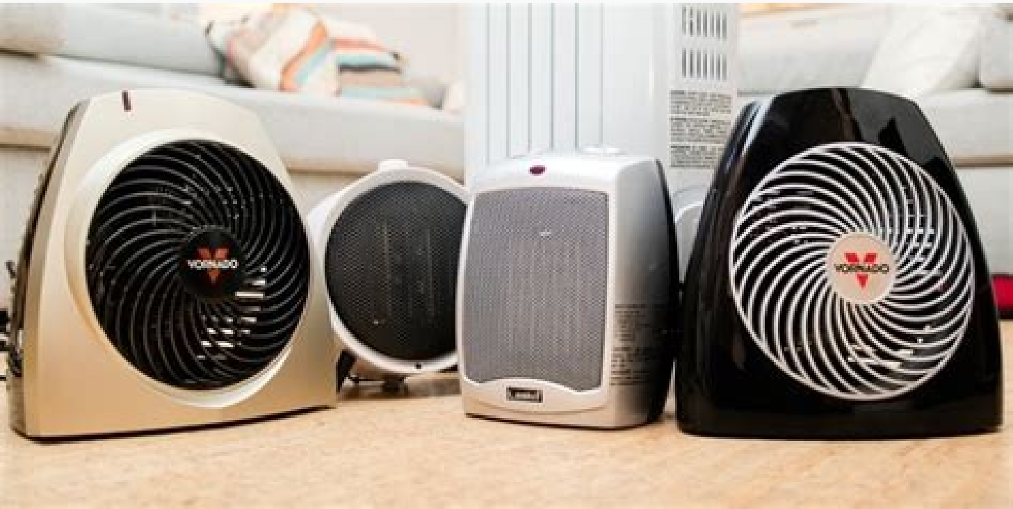
Most energy efficient space heaters consumer reports. Consumer reports reviews of space heaters.